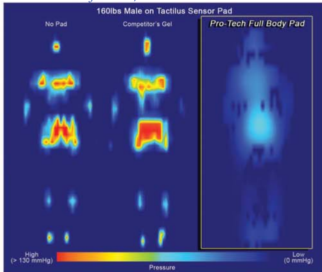
Pro-Tech Full Body Gel Pad, Item 3049

Each test series below illustrates the pressure readings derived from a 160 pound subject lying with no pad, a competing pad, and our pad material.